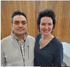
Candidate Sunday Jan. 26, 2020